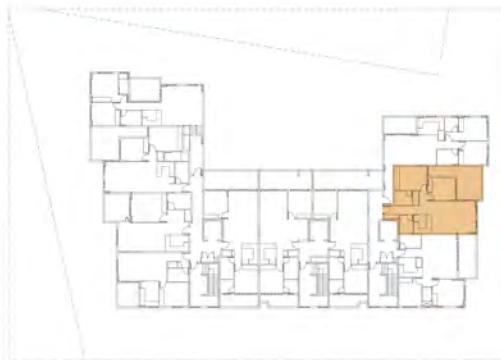
KEY PLAN - FIRST FLOOR PLAN