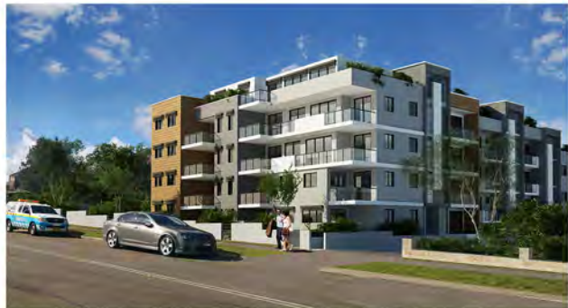
ARTIST IMPRESSION ADDERTON ROAD VIEW