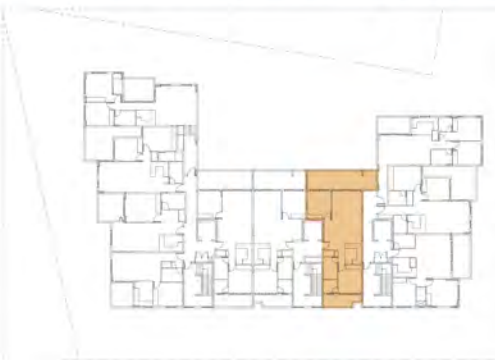
KEY PLAN - FIRST FLOOR PLAN